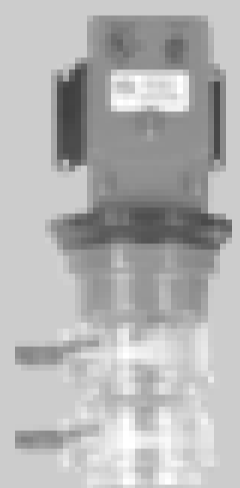
Dual Head Adjustable

45 M Series (50 GPD max) with 1/4" Accessories 45 M Series (50 GPD max) with 3/8" Accessories 85 M Series (85 GPD max) with 1/4" Accessories 85 M Series (85 GPD max) with 3/8" Accessories